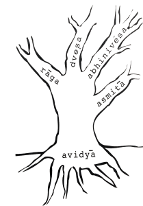
Illustration from The Heart of Yoga by T.K.V. Desikachar